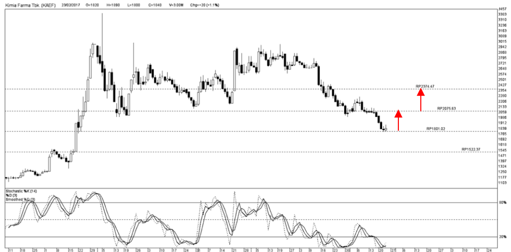
Kinerja harian saham KAEF

Danareksa research report are also available at Reuters Multex and First Call Direct and Bloomberg