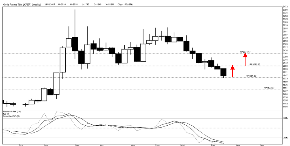
Kinerja mingguan saham KAEF